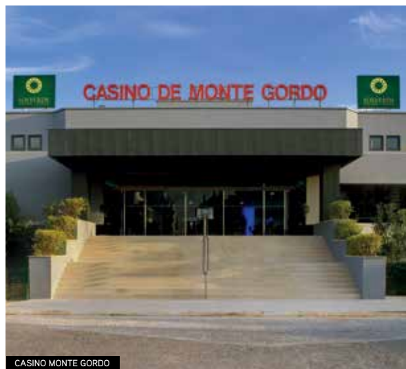
CASINO MONTE GORDO