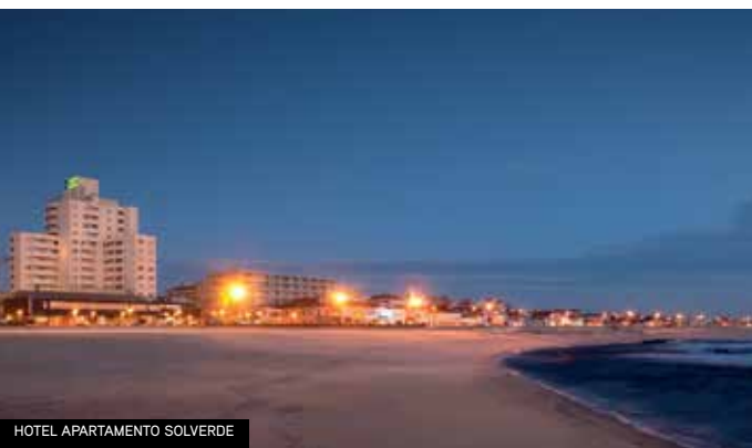
HOTEL APARTAMENTO SOLVERDE