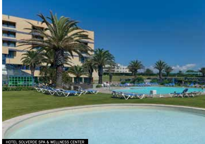
HOTEL SOLVERDE SPA & WELLNESS CENTER