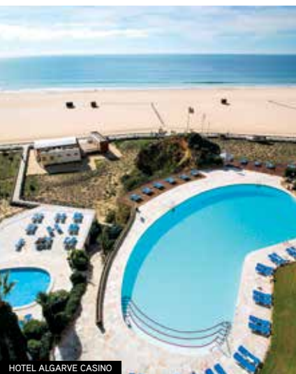
HOTEL ALGARVE CASINO