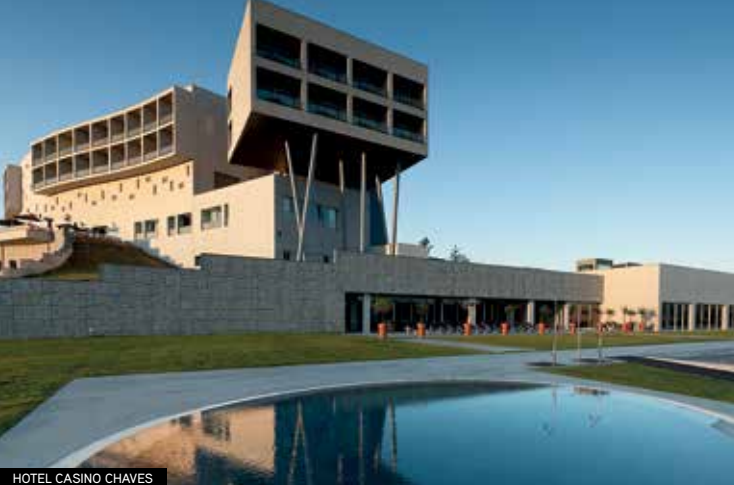
HOTEL CASINO CHAVES