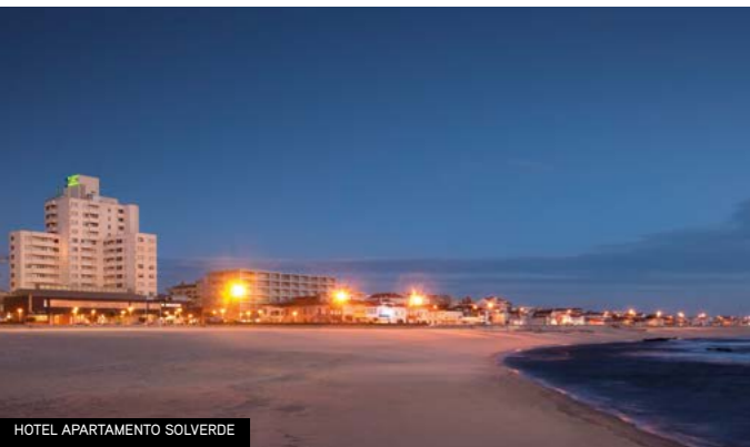
HOTEL APARTAMENTO SOLVERDE