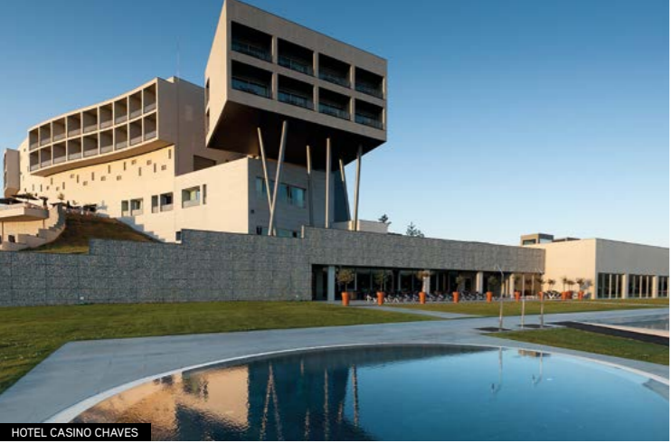
HOTEL CASINO CHAVES