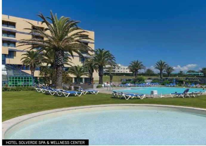
HOTEL SOLVERDE SPA & WELLNESS CENTER