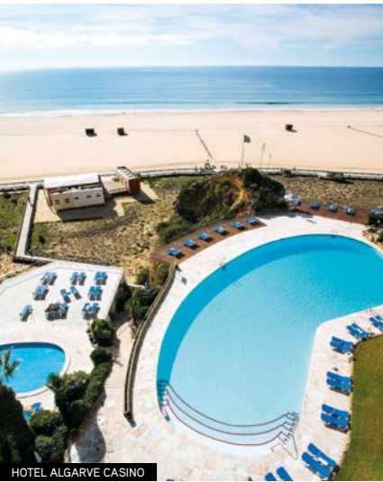
HOTEL ALGARVE CASINO