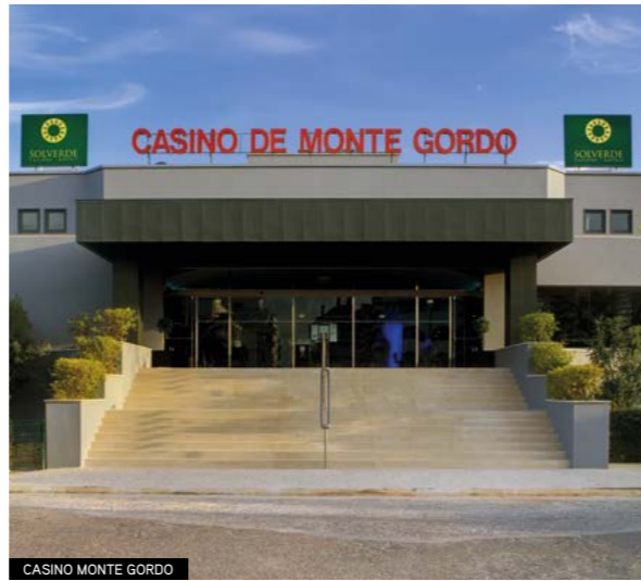
CASINO MONTE GORDO