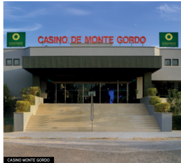
CASINO MONTE GORDO