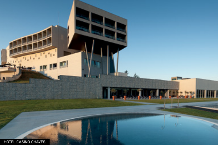
HOTEL CASINO CHAVES