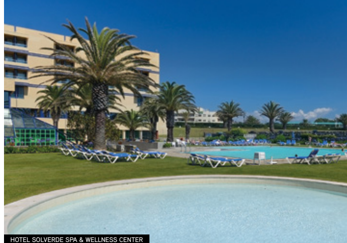
HOTEL SOLVERDE SPA & WELLNESS CENTER