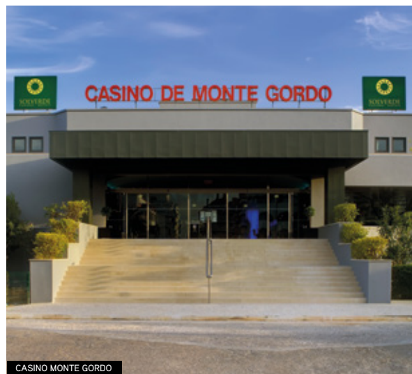
CASINO MONTE GORDO