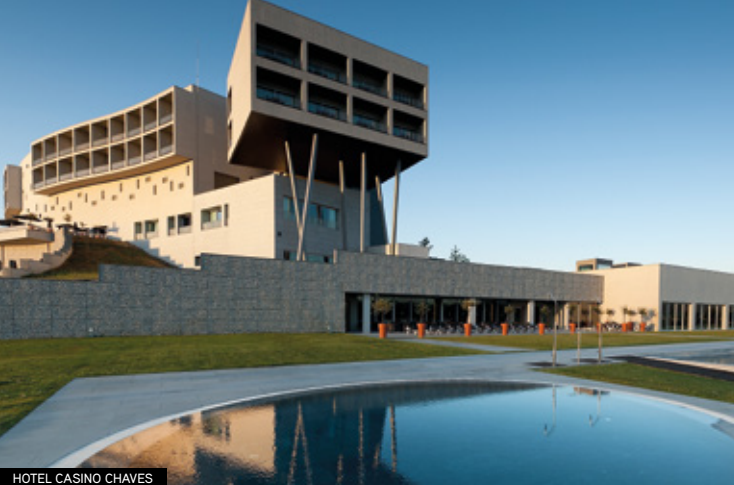
HOTEL CASINO CHAVES