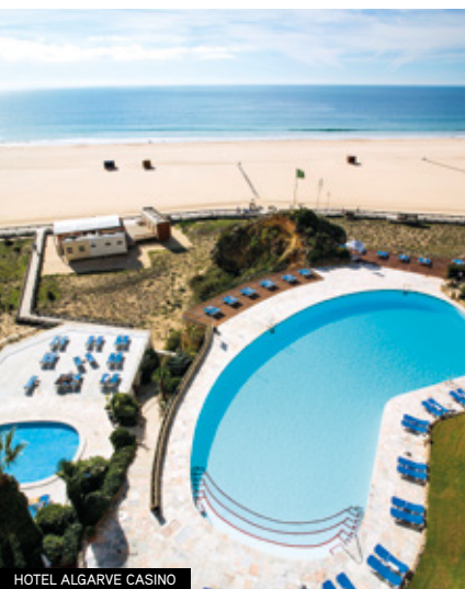
HOTEL ALGARVE CASINO