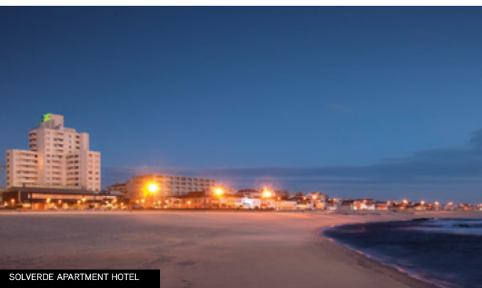
SOLVERDE APARTMENT HOTEL