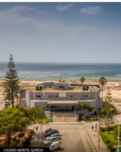
CASINO MONTE GORDO