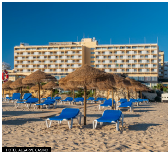
HOTEL ALGARVE CASINO