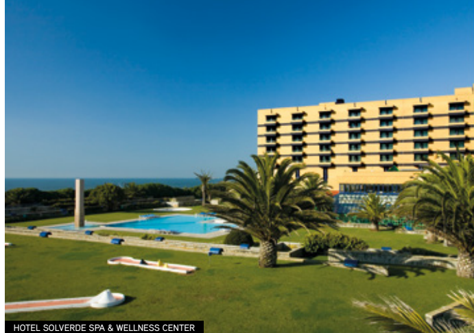
HOTEL SOLVERDE SPA & WELLNESS CENTER