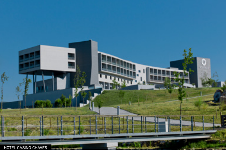
HOTEL CASINO CHAVES