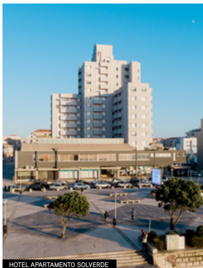
HOTEL APARTAMENTO SOLVERDE