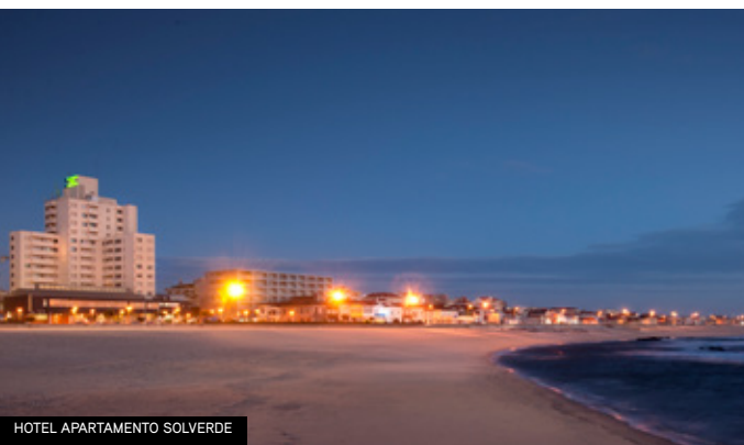
HOTEL APARTAMENTO SOLVERDE