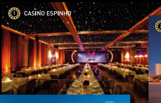
1 CASINO ESPINHO