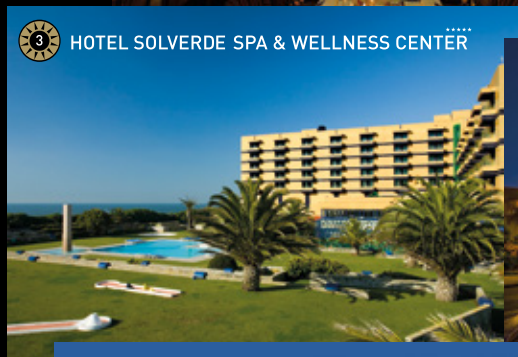
3 HOTEL SOLVERDE SPA & WELLNESS CENTER