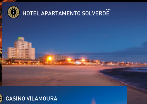
2 HOTEL APARTAMENTO SOLVERDE