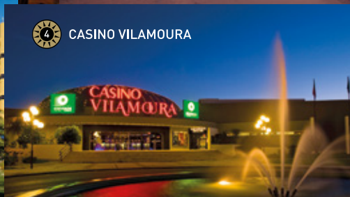
4 CASINO VILAMOURA