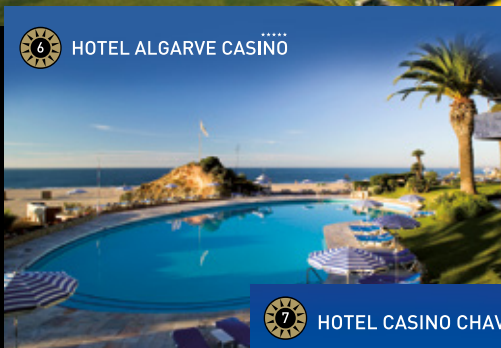
6 HOTEL ALGARVE CASINO