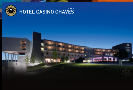
7 HOTEL CASINO CHAVÈS