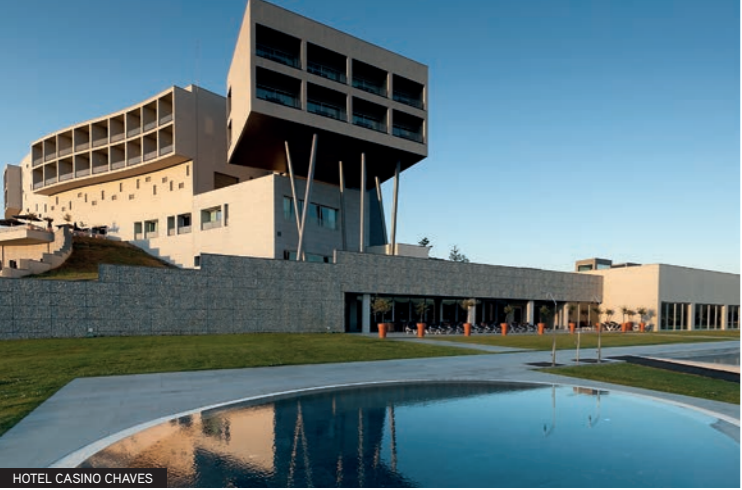
HOTEL CASINO CHAVES