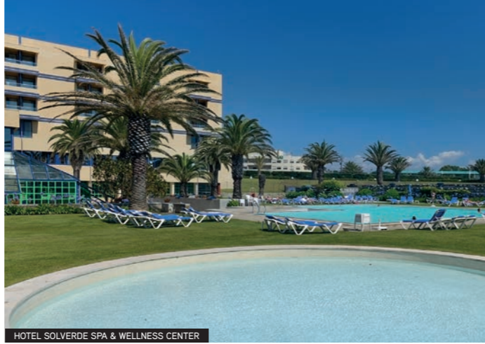
HOTEL SOLVERDE SPA & WELLNESS CENTER