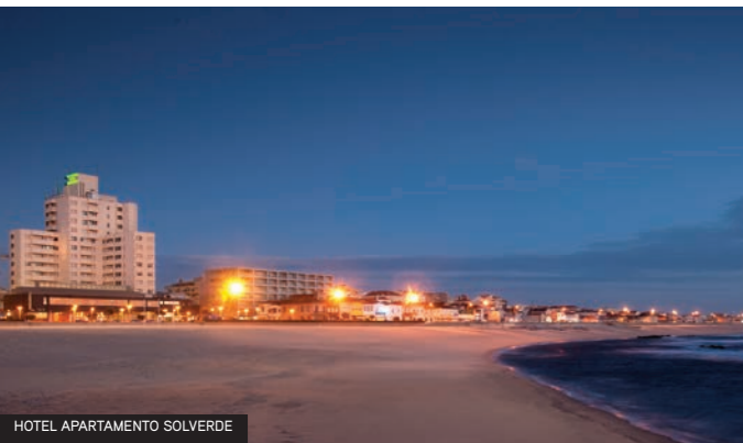
HOTEL APARTAMENTO SOLVERDE