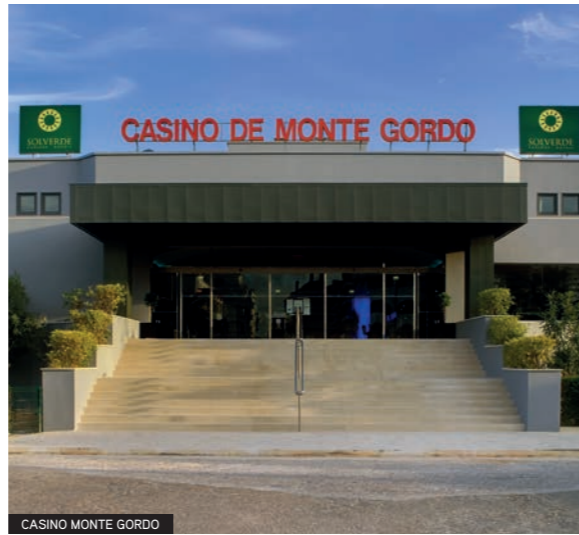
CASINO MONTE GORDO